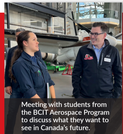
Meeting with students from the BCIT Aerospace Program to discuss what they want to see in Canada's future.

Supporting young people as they enter the workforce is important for both individual opportunity and long term economic growth in Canada. Through the Youth Employment and Skills Strategy, our government is funding programs like Canada Summer Jobs, which create employment opportunities in communities across the country. These programs help young Canadians gain work experience, develop skills, and transition into the workforce. To learn more and see current opportunities, visit jobbank.gc.ca/youth .