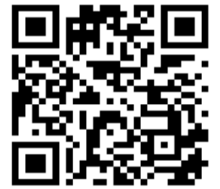
Scan with your phone camera to see the full list of reports