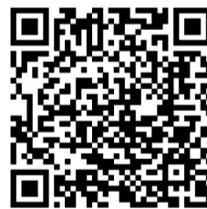
OPEN PEN REPORT

Terry Beech Member of Parliament for Burnaby North-Seymour