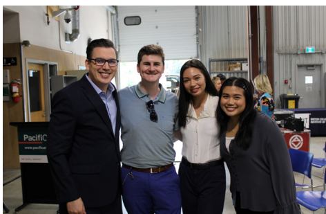
Attending the Honourable Harjit Sajjan's announcement of funding to help several Burnaby-based organizations commercialize new products, acquire advanced technologies and increase sales. Our support is integral as small and medium-sized businesses are the cornerstone of our economy.