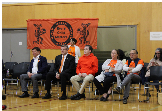
Attending Twseil-Waututh Nation's National Day for Truth and Reconciliation event in support of our Elders who were impacted by Residential Schools and Day Schools. Together, we honour the resilience of Indigenous peoples and commit to building a more just and inclusive future for all.