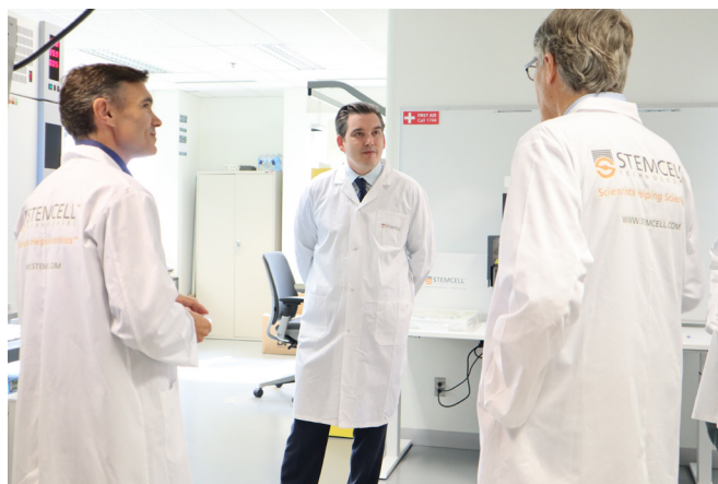
Visiting STEMCELL, a local business known for leaps in innovation for medicine to better understand how their work benefits all Canadians.

Under the program "Peers First," the Burnaby Family Life Institute is dedicated to offering vital support to individuals in our local community. With a commitment of $19,290, this initiative focuses on peer support, combating stigma, and conducting outreach activities to aid vulnerable community members. The program aims to equip peers with effective communication skills and tools for harm reduction. By addressing the stigma faced by those with lived or living experience of substance use, this initiative is poised to make a meaningful impact. Additionally, the program will empower peers to engage in outreach efforts targeting vulnerable community members who may be facing challenges such as racial discrimination, economic hardship, homelessness, a lack of belonging, mental illness, and pain.