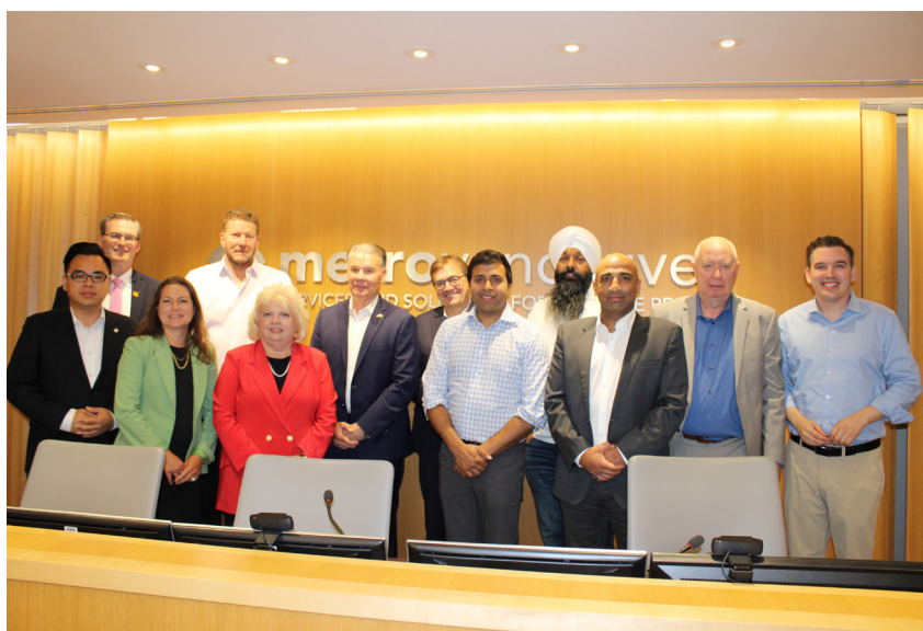
Discussing community growth through investments in infrastructure and housing with members of Liberal MP Colleagues and the Metro Vancouver Board.