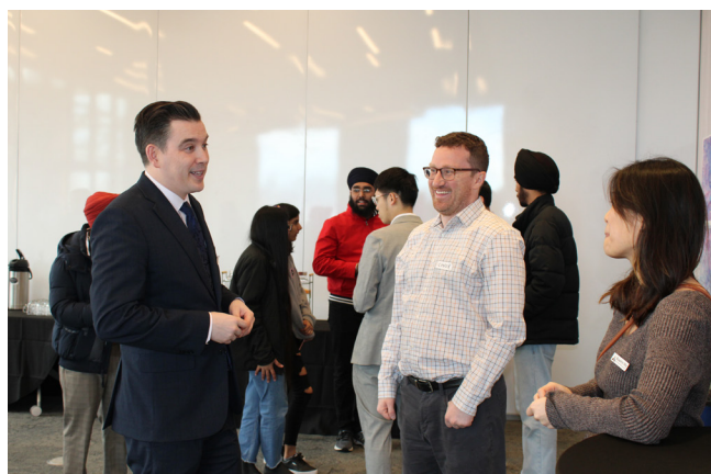
Meeting with the Capilano Students Union in constructive conversations to build better relationships with our community.