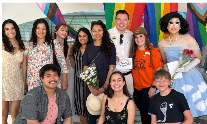
Engaging with the 2SLGBTQ+ in Parkgate to foster an inclusive space to support community action.