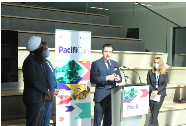
Announcing the creation of PacifiCan to create more economic opportunities in British Columbia.

As a Centre of Excellence for Commercialization and Research of the Networks for Centres of Excellence program, Simon Fraser University has received $1,807,000 from the Natural Sciences and Engineering Research Council, $1,787,400 from the Canadian Institutes of Health Research and $450,000 from the Social Sciences and Humanities Research Council. This will match funding from corporations, forming a private-public partnership to advance research.