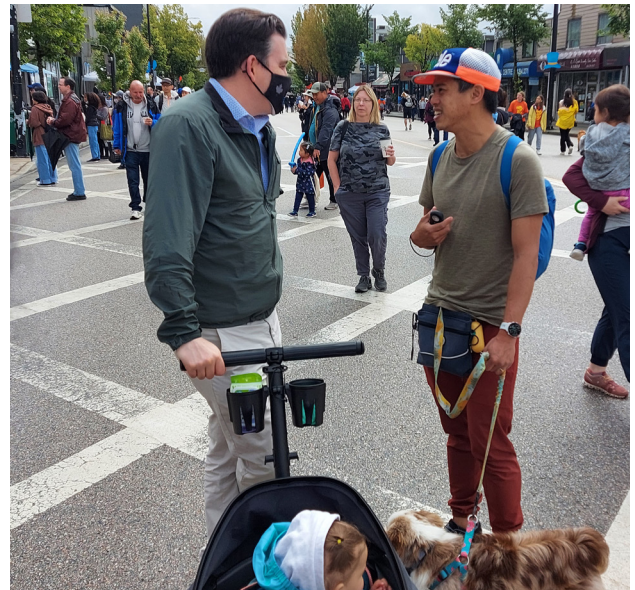
Speaking with community members during Hats Off Day.