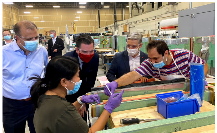
Visiting manufacturing facilities in our community with Minister of Innovation, Science and Industry François-Philippe Champagne. Our government's investments protected jobs during the pandemic and have recovered more than 117 percent of the jobs lost to the pandemic.