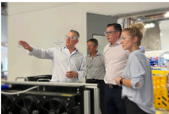
Meeting with the leadership of Loop Energy to learn more about how our government's investments will create 119 jobs in our community.

Our government is committed to ensuring that First Nations affected by natural disaster emergencies like the recent flooding in British Columbia are safe and secure. In partnership with First Nations communities, provincial and territorial governments, and non-government organizations, Indigenous Services Canada's Emergency Management Assistance Program (EMAP) helps communities on reserve access emergency assistance services. As part of this overarching plan, our government has supported the First Nations Emergency Services Society of British Columbia with over $2,959,606 in funding. In response to the magnitude of the impact the flood has on our communities, the First Nations Emergency Services Society of British Columbia has additionally received $1,716,978 and 237,000 from the EMAP and Department of Crown-Indigenous Relations and Northern Affairs, respectively, to support the construction and maintenance of community infrastructure in North Vancouver, and $270,000 from the Department of Indigenous Services to supply emergency public services and administrative support.