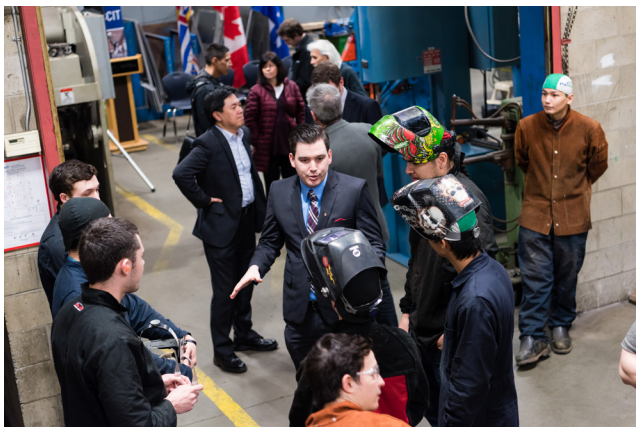
Speaking with welding apprentices at BCIT about how our government has invested in making it easier to get certified in a Red Seal Trade.

Through the Department of Innovation, Science, and Economic Development, we are working to ensure Canadians of all backgrounds have equitable access to infrastructures and tools to support innovation and skill development across all disciplines. That is why we are investing $1,870,804 in research, innovation, and skill development programs at non-profits like Simon Fraser University, the British Columbia Technology for Learning Society, the Burnaby Neighbourhood House Society, and innovative local businesses like Nano One Materials Corps.