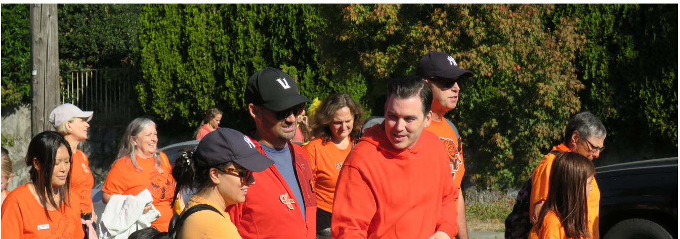
Walking alongside members of Tsleil-Waututh Nation during their memorial walk on Truth and Reconciliation Day.

Our government has prioritized improving the safety and well-being of Indigenous peoples. The over-representation of Indigenous peoples in our criminal justice systems, as both victims and offenders, is an injustice that we must address. The Aboriginal Community Safety Development Contribution Program focuses on community safety and well-being in Indigenous communities through two initiatives. The Indigenous Community Corrections Initiative funds community-based, culturally relevant projects that provide alternatives to incarceration and reintegration support for indigenous offenders. The Aboriginal Community Safety Planning Initiative supports Indigenous communities in identifying community safety and wellness issues and developing Community Safety Plans that are responsive to the unique circumstances of each community. The Native Courtworker and Counseling Association of British Columbia received $276,310 under the Indigenous Community Corrections Initiative to help Indigenous people obtain fair, just, equitable, and culturally sensitive treatment in the criminal justice system.