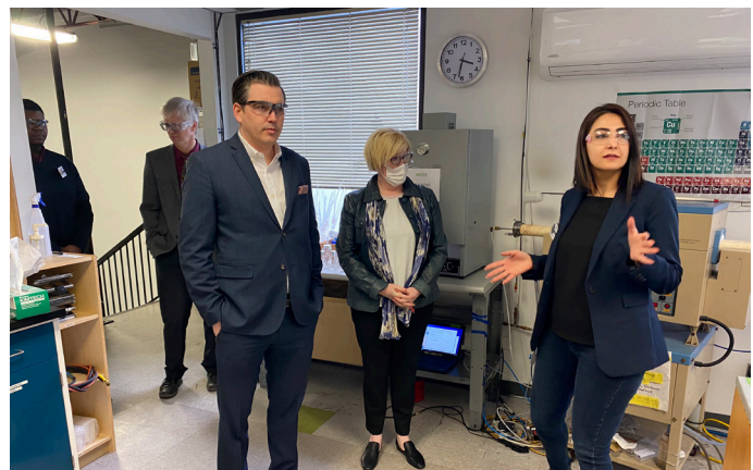
Touring NanoOne Technologies with Minister Carla Qualtrough.