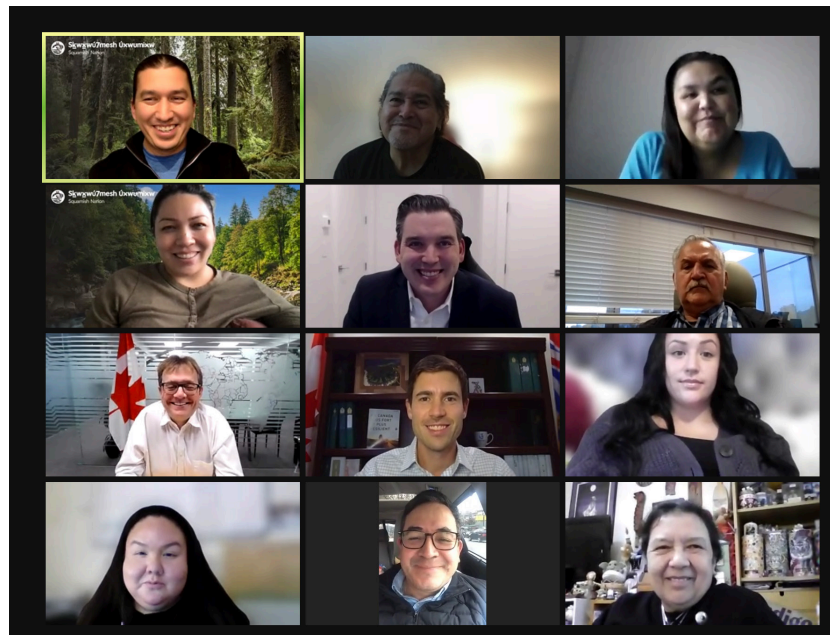
Meeting with Members of the Squamish Council alongside North Shore MPs Patrick Weiler and Jonathan Wilkinson.

In response to recent floods, the First Nations Emergency Services Society of British Columbia has received $1,716,978 and 237,000 from the EMAP and The Department of Crown-Indigenous Relations and Northern Affairs. These funds will support the construction and maintenance of community infrastructure in North Vancouver. An additional $270,000 from the Department of Indigenous Services will be used to supply public services and administrative support.