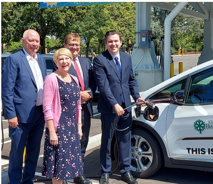
Announcing new charging stations across British Columbia with Natural Resources Minister Johnathan Wilkinson, MLA Janet Routledge, and Mayor Mike Hurley.

Under our government's leadership, the Department of Canadian Heritage has continued to share, preserve, and honour Japanese heritage. The Nikkei National Museum & Cultural Centre in Burnaby has received $211,087 in contributions during the pandemic under the Museums Assistance Program and the Covid-19 Emergency Support Fund for Cultural, Heritage, and Sport Organizations. The Museum cares for and presents 2600+ objects, 47,000+ photographs, 44 meters of textual records, 650+ oral history recordings, and 156 film reels of historically and culturally significant items. Their work is expanding our understanding of Japanese Heritage and History while protecting the legacies of Japanese Canadians.