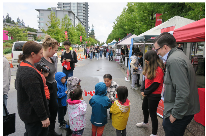
Speaking with families during SFU's StreetFest.